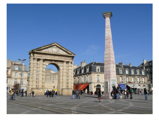
Place de la Victoire

The Cours de la Marne eventually opens out on the Place de la Victoire containing the twizzled Colonne de la Vigne et du Vin (4), a nod to where the city's great wealth came from - and some vine-munching tortoises, well why not?