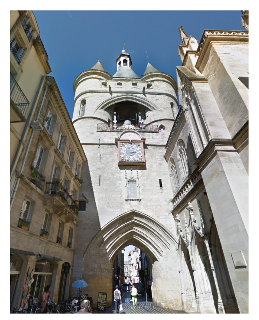
Grosse Cloche

I call to arms, I announce the days, I give the hours, I chase the storm, I ring the parties, I scream fire.