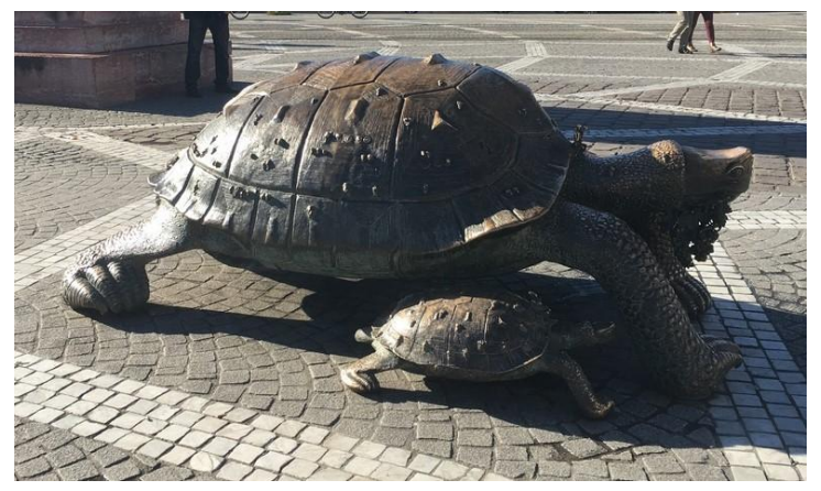
Tortues de la victoire