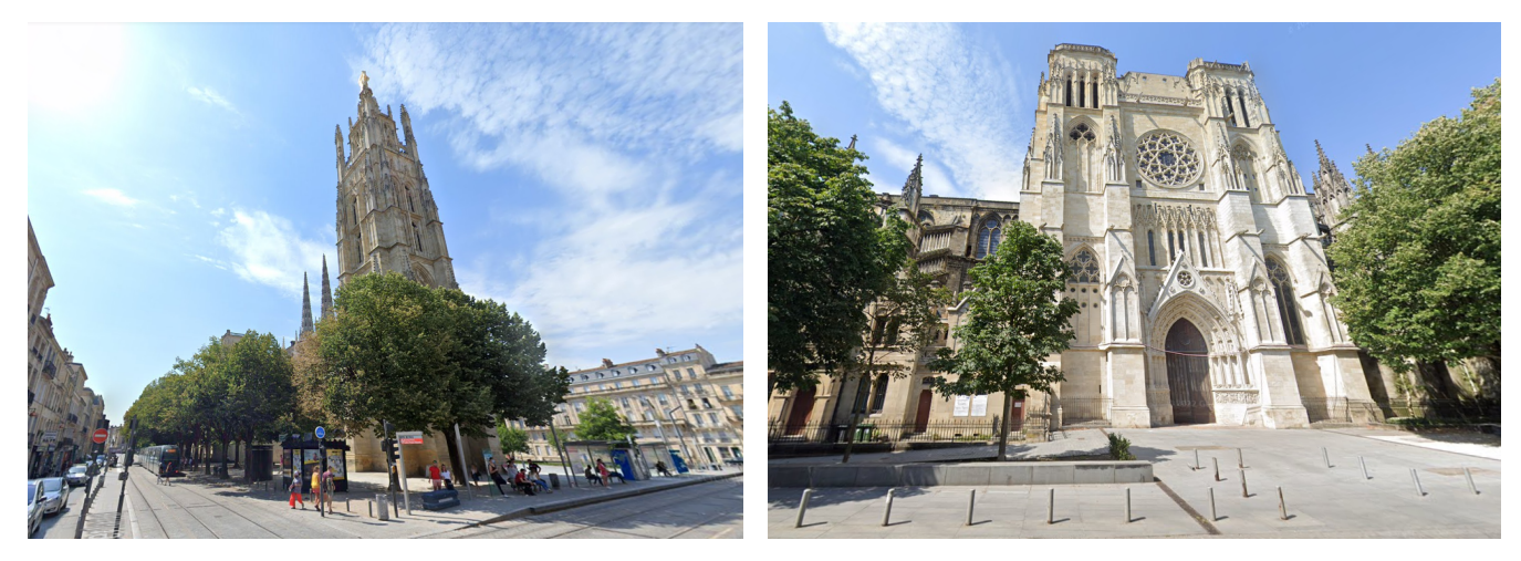
Pey Berland - Google

From the blue route (see above), turn left and go down Cours d'Alsace-et-Lorraine to the Cathedral and past the Pey Berland tower, which you can climb for some great views (12).