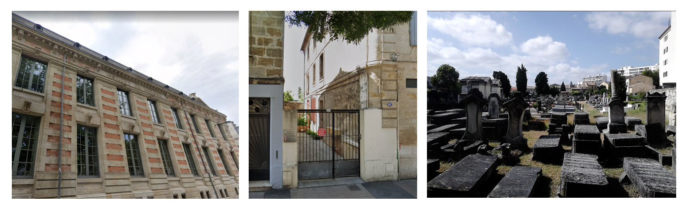
Zoological Institute - Google

A little further on on the left is the entrance to the Jewish cemetery (2) which has tombs dating back to the 18th Century The Jewish community originally came from Portugal and the Comtat Venison (Carpentras).