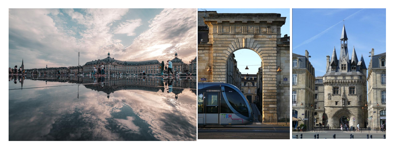
Water mirror

Go through Porte Cailhau (8) on the right - it was probably designed to be imposing - it's just the surrounding buildings that make it seem cute.