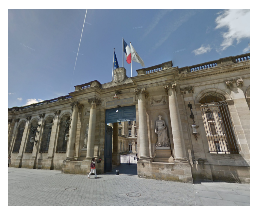
Hotel de Ville - google

Go back towards the cathedral and in between the Cathedral and the Hotel de Ville (14).