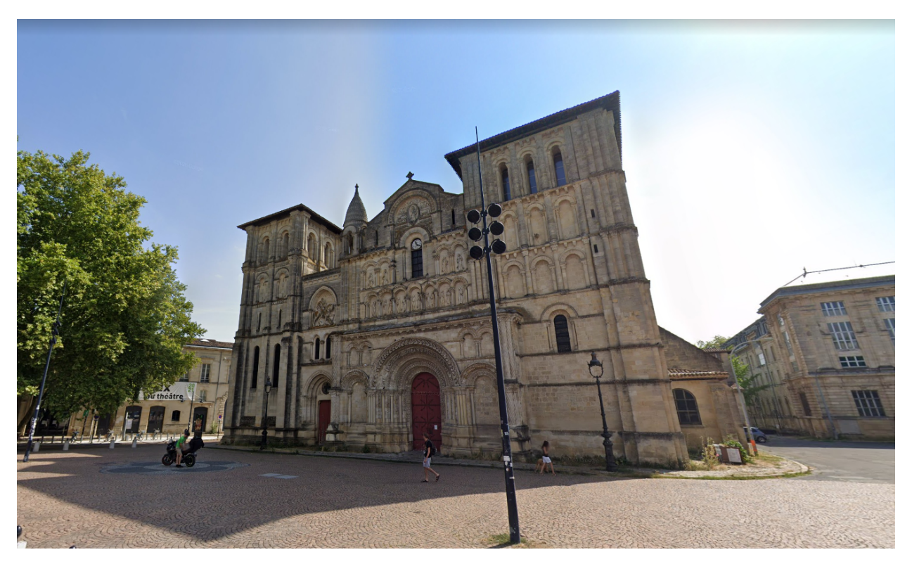
Saint Croix

church of Saint Croix church (11), which was the parish church of the village which has been consumed by Bordeaux. Behind it is the <u>Bordeaux Conservatoire</u> for fine arts.