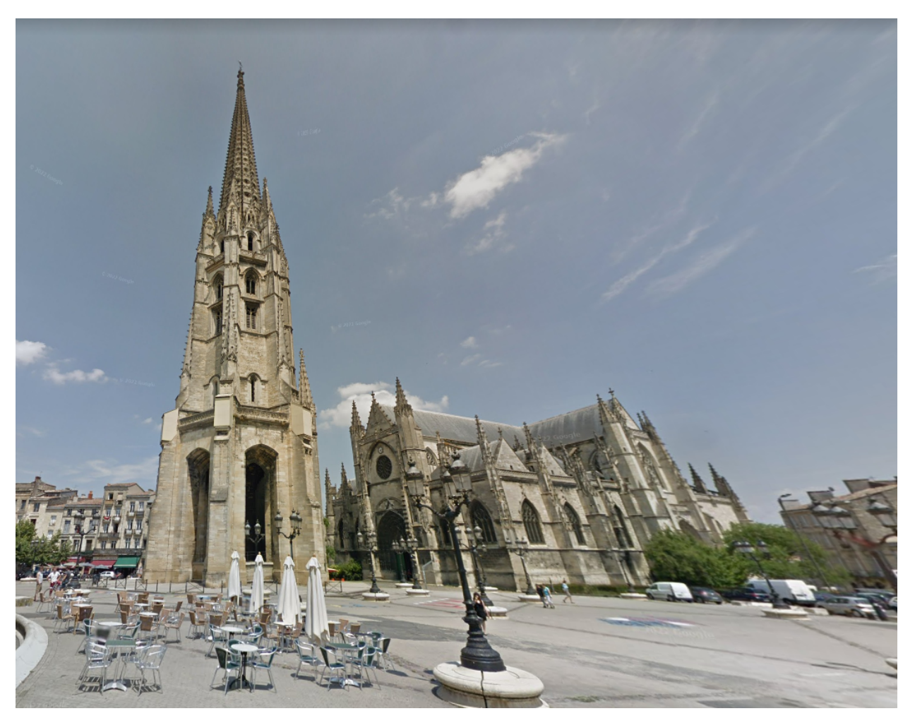
Saint-Michel - Google

Around the back of the church, Rue des Allamandiers leads to the Saint-Michel sports fields which have the UNESCO listed riverfront as a backdrop (12).