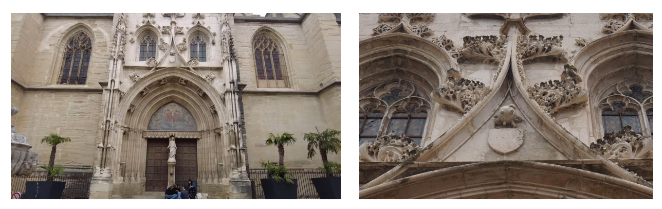
Porte des Juifs