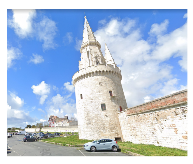
Lantern tower

If you fancy a paddle, you could walk down to the beach (marked in red on the map) otherwise let's head back down Rue des Fagots and then turn right on to the café-lined Rue St Jean du Pérot which takes us back to the harbour-front.