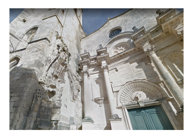
Saint-Sauveur - Google

Turn right on to Rue Saint-Sauveur which leads to the church of Saint-Sauveur (12) with its mish-mash façade. The remaining bits of ornate gothic arches give a glimpse of what the current more classical facade replaced.