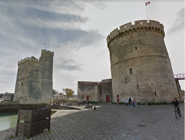
St Nicolas tower - Google