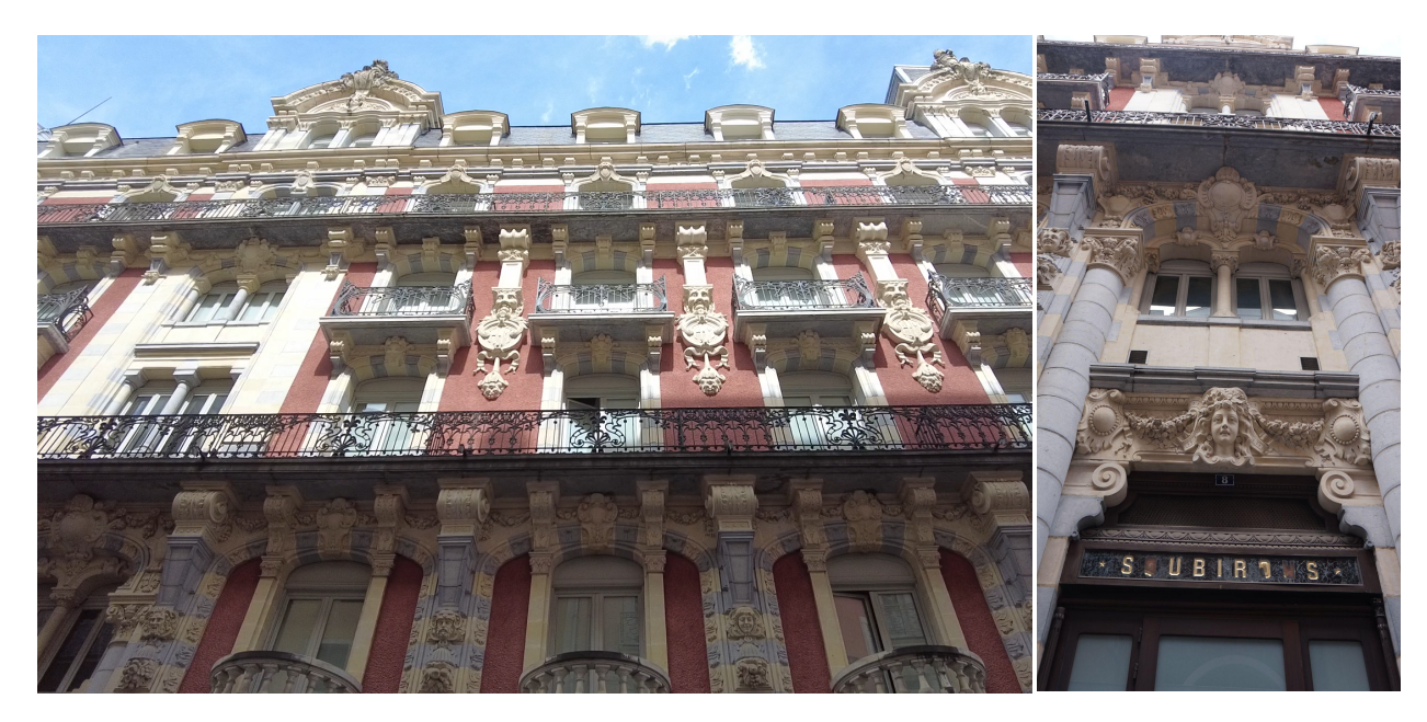
Grand Hôtel Moderne

Continue along Avenue Soubirous and over the bridge to your left (Pont Vieux) and up the slope of Rue de la Grotte and past Lourdes' own version of Madame Tussauds, the Musée de Cire (6). You'll also see the old fortress poking above the buildings, which we will go past later.