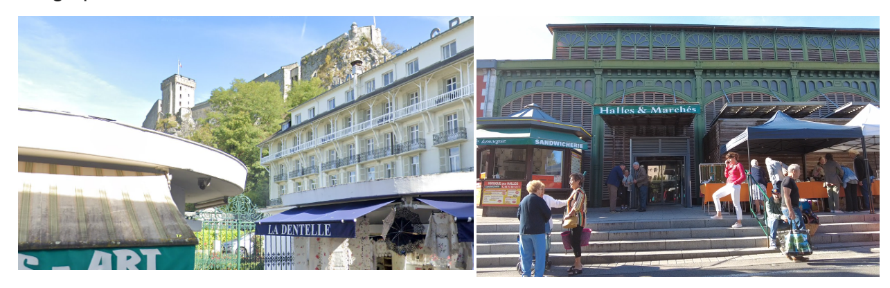
Fort Museum Les Halles

Continue along Avenue Soubirous and over the bridge to your left (Pont Vieux) and up the slope of Rue de la Grotte and past Lourdes' own version of Madame Tussauds, the Musée de Cire (6). You'll also see the old fortress poking above the buildings, which we will go past later.