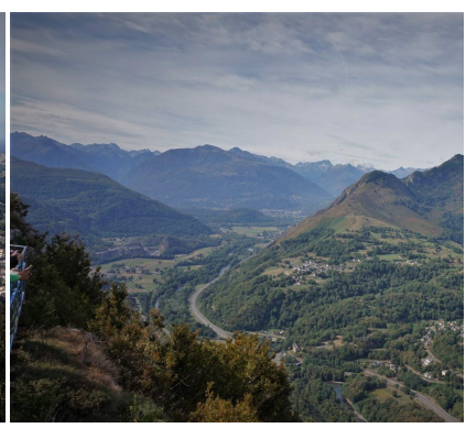
Pic du Jer