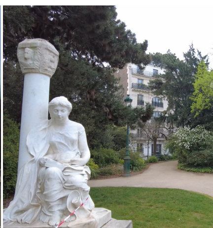
Arènes de Lutèce

It's a pleasant spot to sit and nibble a sandwich, but if you are looking for Roman arenas, it probably isn't worth cancelling your trip to <u>Nîmes</u> or <u>Arles</u>. From the arena you can extend your walk and take in the <u>Pantheon</u> and the <u>Luxembourg gardens</u>, which house the Senate, a mini-statue of liberty and a curious <u>puppet theatre</u> (see below).