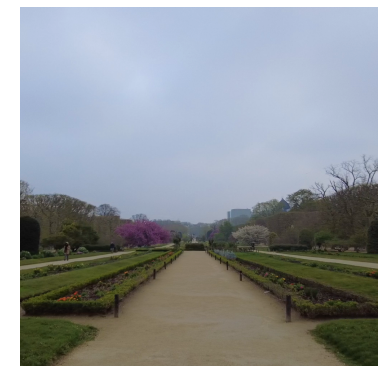
Jardin des Plantes

Walk to the top of the park which is dominated by the Grande Galerie de l'Évolution (4). As you leave by the exit to the left of the Galerie, you'll see a white building (or series of buildings) with an Arabic feel. It's the <u>Grand Mosque</u> (6) and the bit closest to you is the <u>restaurant</u> (5) if you're feeling peckish.