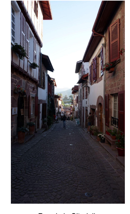
Porte de France - google