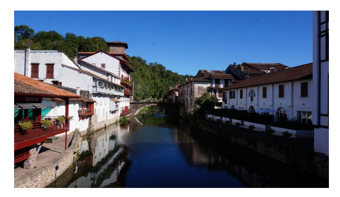
Porte Notre-Dame Vieux Pont

Pass through the port which leads onto the Vieux Pont/old bridge (7) which runs over the trout and midge filled Nive de Beherobie.